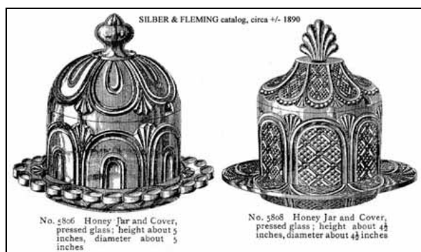
Abb. 2009-3/233 Moulded Honeys [Honigtöpfe], MB Silver & Fleming, um 1890 Sammlung Lethbridge