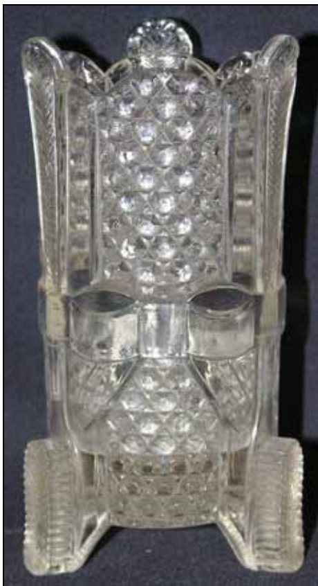
Abb. 2008-1/353 neues Bild Zahnbürstenhalter farbloses Pressglas, H ca. 12 cm, D oben ca. 6 cm Sammlung Rühl & Sadler vgl. MB Brockwitz 1915, Tafel 132, Nr. 6950 vgl. China, Glass and Lamps, July 6, 1898, US Glass Co.